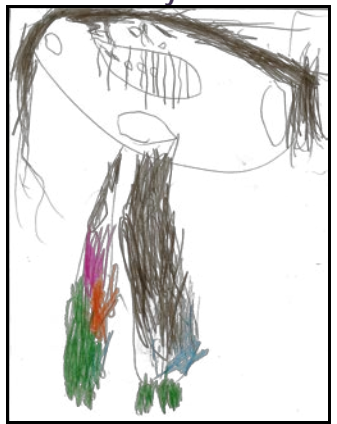
Mom with pants and hair